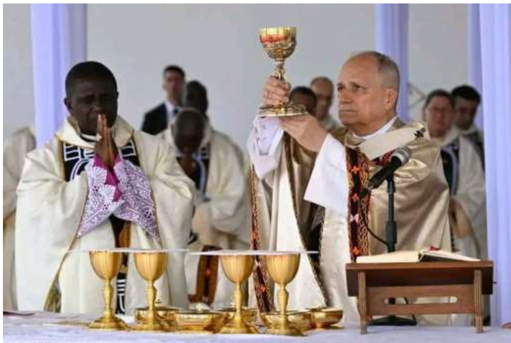
Pope Leo XIV presiding a Eucharist in Cameroon, April 2026

On April 15, Pope Leo XIV, on an apostolic visit, delivered his first address on Cameroonian soil, at the Unity Palace in Yaoundé. He made a strong appeal to the authorities, civil society, and the diplomatic corps, urging them to improve governance, prevent violence, and restore hope to the youth.