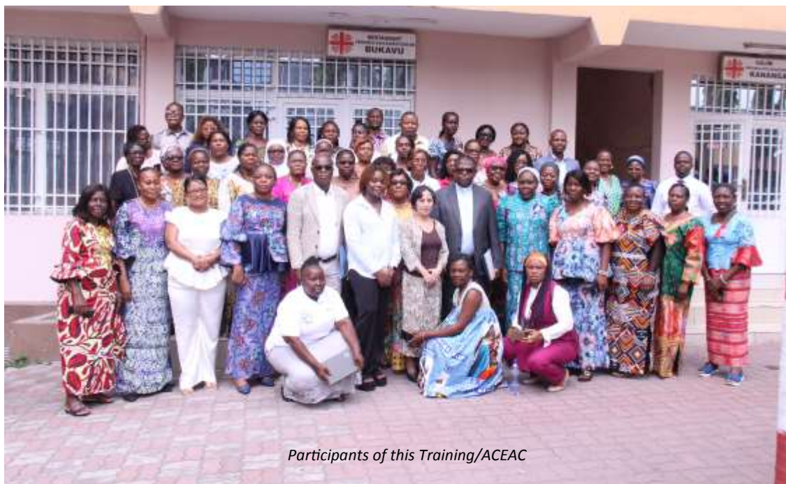
Participants of this Training/ACEAC

In Kinshasa, approximately fifty women community leaders were trained from April 20 to 25, 2026, on human rights and combating discriminatory practices.