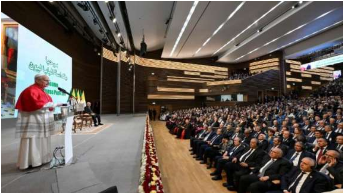
Pope Leo XIV addressing authorities in Algiers, April 2026

First destination on Pope Leo XIV's first visit to Africa: Algeria, from April 13 to 15, 2026. A deeply meaningful pilgrimage in the footsteps of an African, Saint Augustine, Doctor of the Church, his spiritual father, as this pontiff is a member of the Order of Saint Augustine. During his stay, he called for unity, justice, and peace.