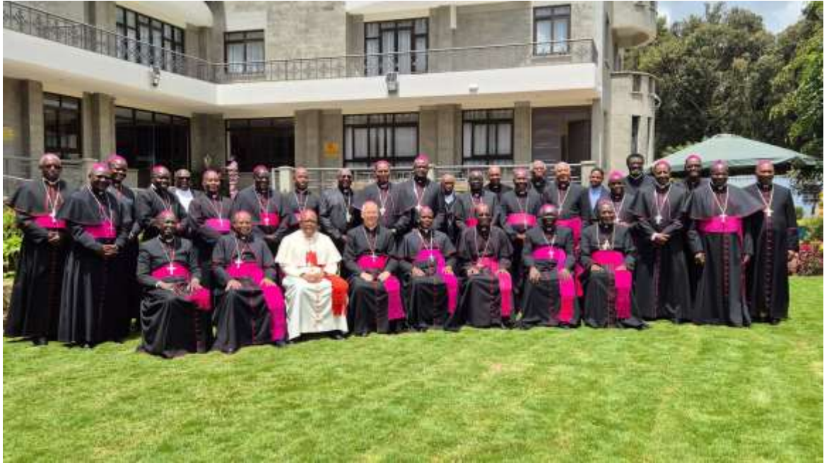
Cardinal Fridolin Ambongo, in white, among Kenyan Bishops

The President of the Symposium of Episcopal Conferences of Africa and Madagascar (SECAM), Fridolin Card. Ambongo, recently congratulates and encourages the Catholic Bishops in Kenya in their efforts to intensify evangelization, unity and synodality.