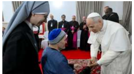
Pope Leo XIV visiting a care home for the elderly in Annaba, Algeria, April 2026

To the authorities and civil society, the Pope then addressed them, saying: "The authorities are called not to dominate, but to serve the people and their development. The criterion for political action therefore lies in justice, without which there is no authentic peace, and is expressed through the promotion of fair and dignified conditions for all."