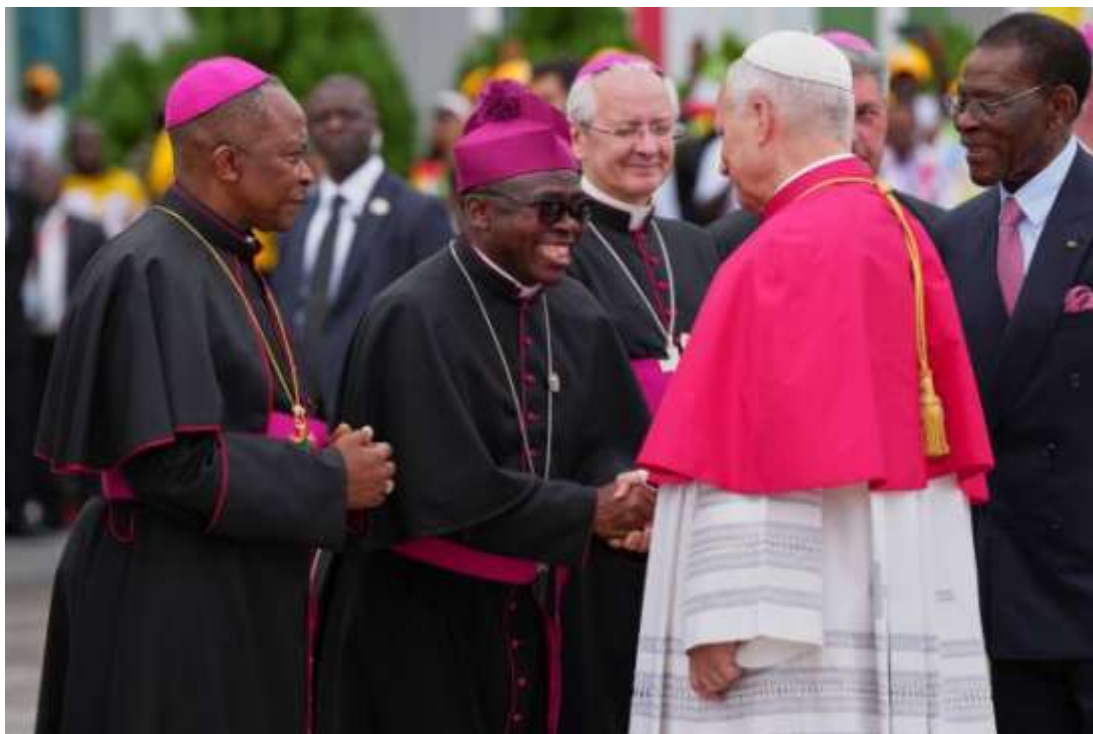
Pope Leo XIV in Equatorial Guinea, April 2026

During his visit to Equatorial Guinea from April 21 to 23, 2026, Pope Leo XIV denounced exclusion and called for hope.