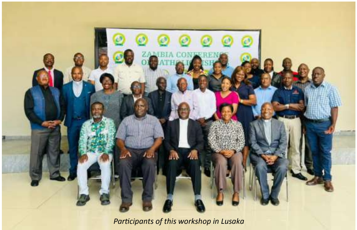
Participants of this workshop in Lusaka

As Zambia approaches its general elections in August 2026, a high-level capacity-building training was held in Lusaka, Zambia, from April 20-21, 2026, to promote a transparent and democratic election process.