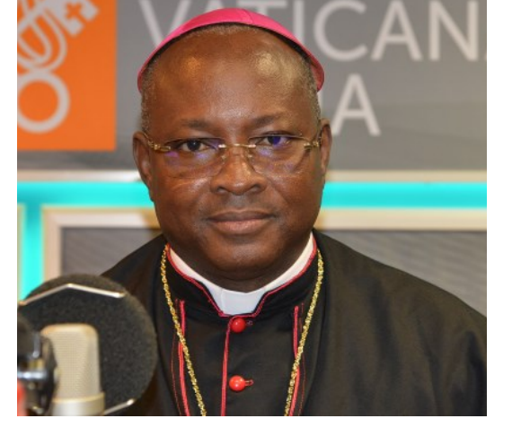
Cardinal Fridolin Ambongo