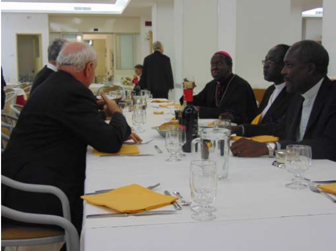
Archbishop Paglia at Lunch with some of the Bishops.