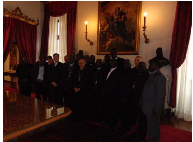
SECAM delegation with cardinal Filoni and his staff

A number of the bishops made contributions on what the Church in Africa is doing to address of the negative tendencies that are keeping the continent from developing faster than it is doing presently.