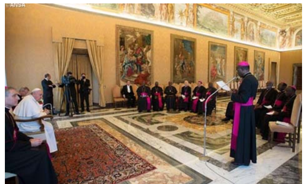
Archbishop Mbiligi addressing the message below to Pope Francis:

The Bishops invited the Pope to Africa, this year and in particular to their 19 th Plenary Assembly in Uganda in 2019. That Assembly will also mark the Golden Jubilee of the founding of SECAM.