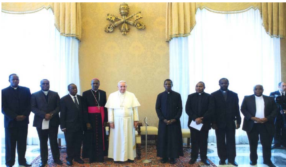
Pope Francis with the President of SECAM and staff of SECAM Secretariat

After the audience the Bishops presented a wood carving, depicting the Good Pastor, to Pope Francis.