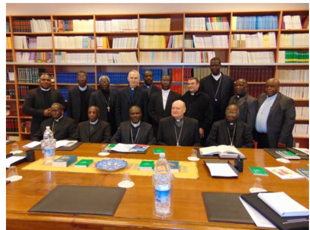
SECAM Delegation at the Pontifical Council for Culture. For some information on the PCC Please see Appendix.....)

Cardinal Ravasi made reference to Culture e Fede Vol. XVII 2010 N. 4 Theme: Africa and Culture a publication of the Council which specifically discusses development in Africa, practices that are destructive to the African ecosystem, and the wider societal implications that result. Another pertinent topic is the introduction of technological and scientific advances in Africa. He appealed to the Church in Africa to pay more attention to the education of the youth who are being affected by the negative side of the internet. " it is a pastoral duty." he stressed.