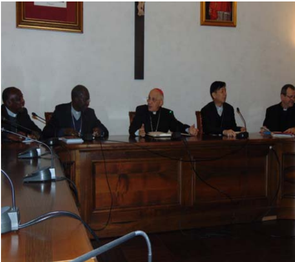
Cardinal Filoni and his staff addressing the SECAM delegation

Cardinal Filoni gave a history of his Congregation with specific reference to what it has been able to achieve in Africa. The Congregation he said would like to give more service to the continent of Africa and therefore the need for the collaboration of each Episcopal Conference to do more for the evangelization and the integral development of the continent. He commended SECAM for having developed a Strategic Plan.