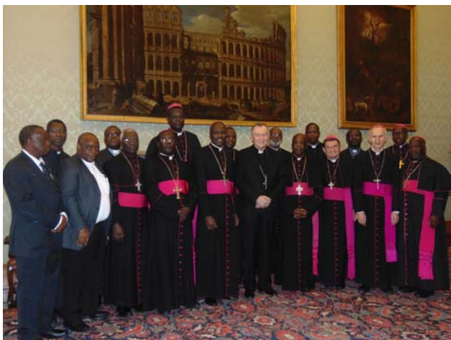
SECAM delegation with the Secretary of State, Cardinal Parolin at his office at the Vatican

Cardinal Parolin commended SECAM for making this first visit to the Vatican. He hoped that the discussions the