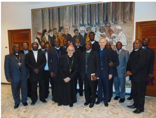
SECAM delegation with Cardinal Turan President of the Pontifical Council for Inter-religious Dialogue.

Please Appendix .. for some information on the Council.