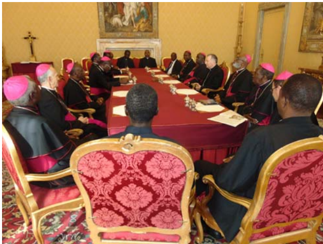
Cardinal Parolin with the SECAM delegation

He also briefed the Secretary of State on the visits that the bishops made to the dicasteries and that of the audience they had with the Holy Father just before meeting him( Cardinal Parolin).