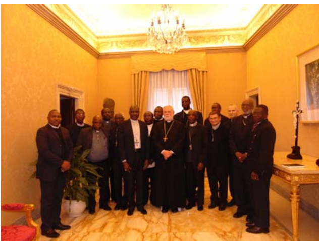
Archbishop Gallagher with the delegation of SECAM

In commending SECAM for the great work it is carrying out Archbishop Gallagher asked the Church to work closely with Governments for the integral development of the people of Africa without compromising the Teaching of the Church.